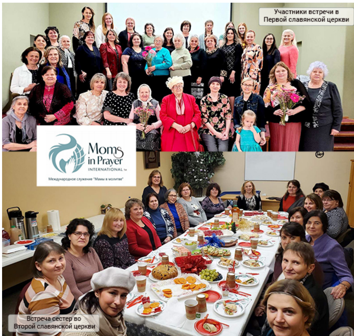
During the meeting at the First Slavic Churches