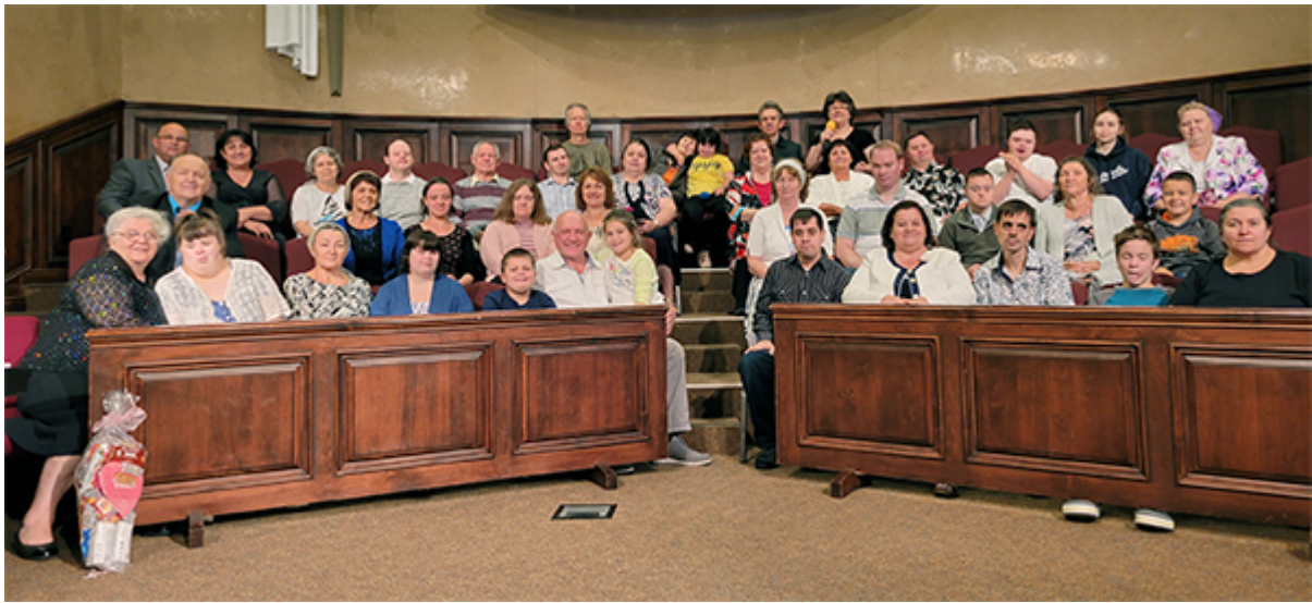
Special Moms with their Special Children and Guests