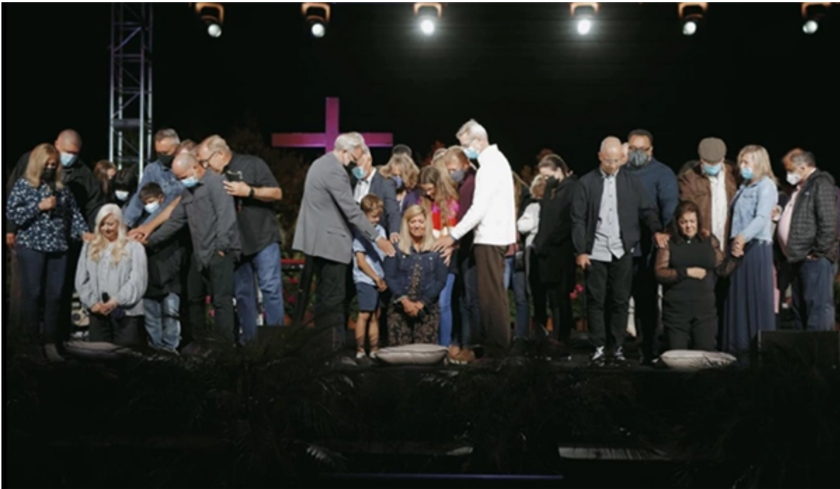
Ordination of Women at Saddleback Church