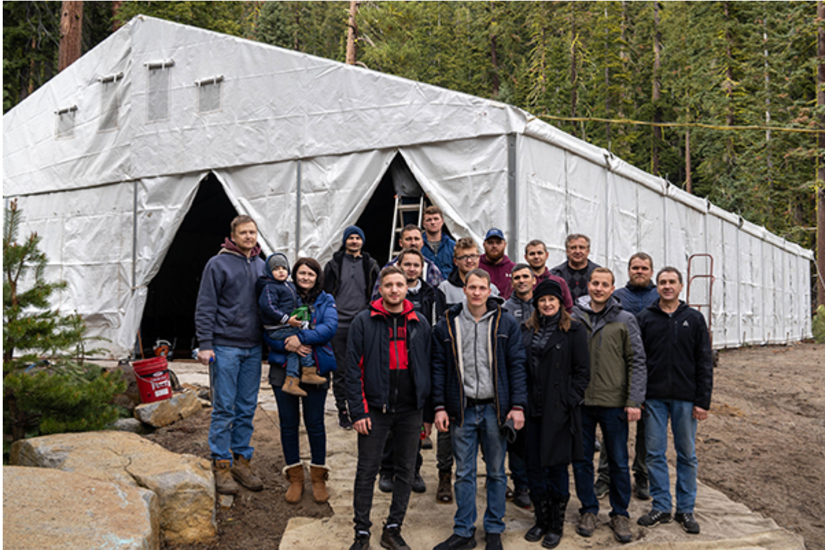
A small part of the volunteer team