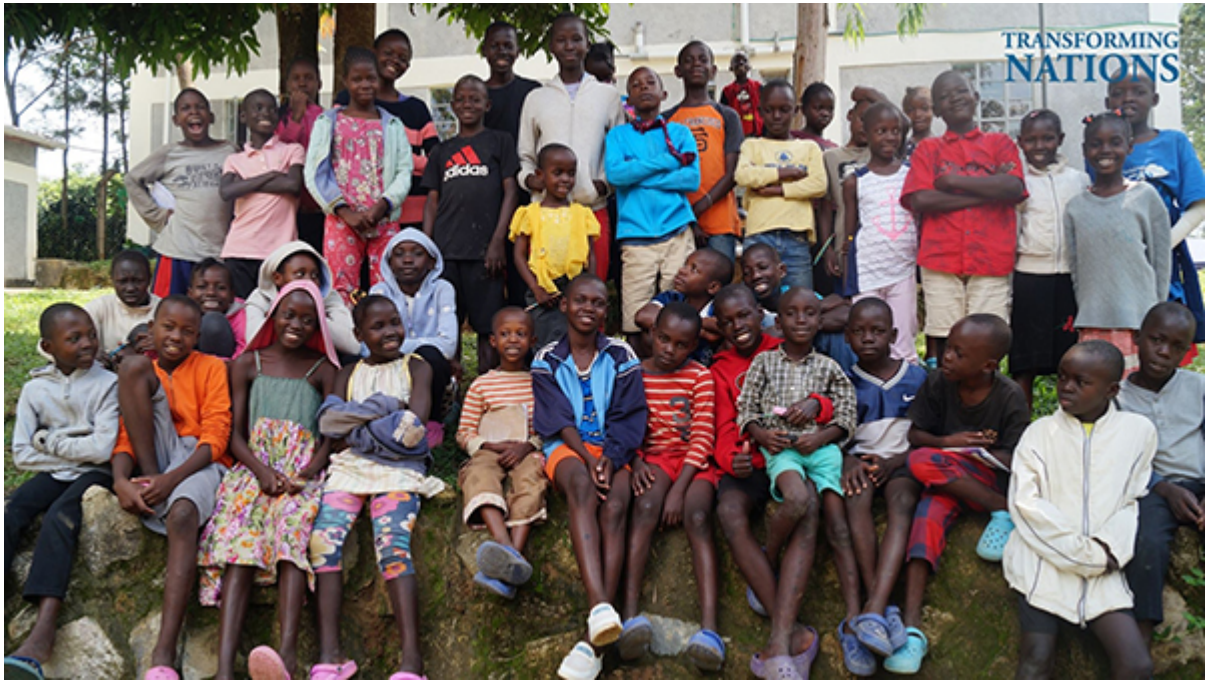
Neglected Children and Orphans Whose Lives Were Changed Thanks to the Ministry