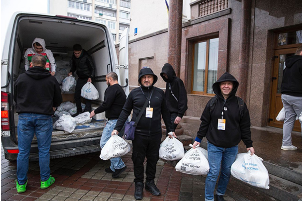
Gifts for the Refugees