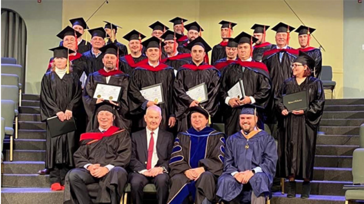
Graduates and instructors