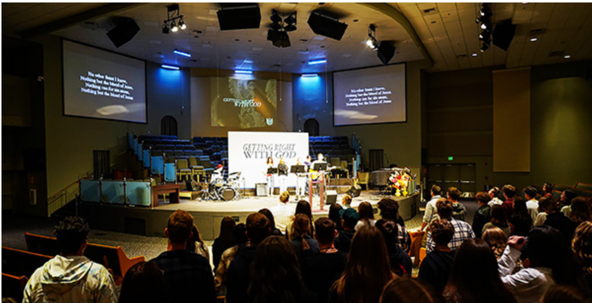
During the conference