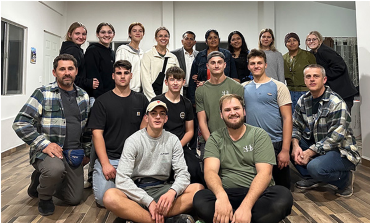
The team of missionaries with local brothers and sisters