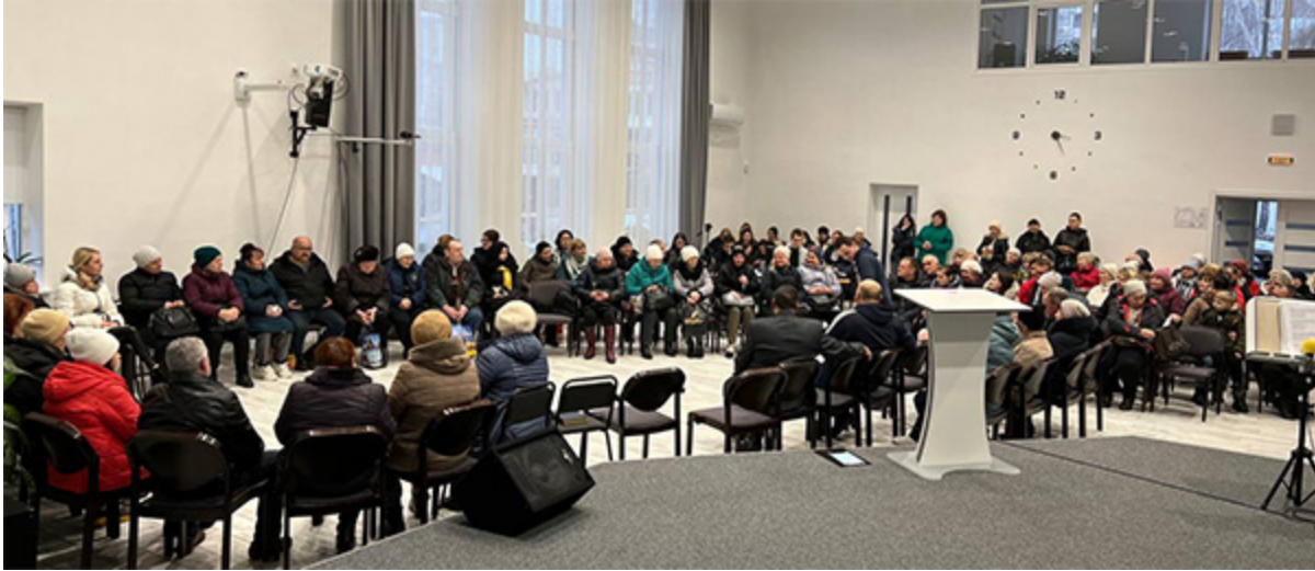
One of many meetings...