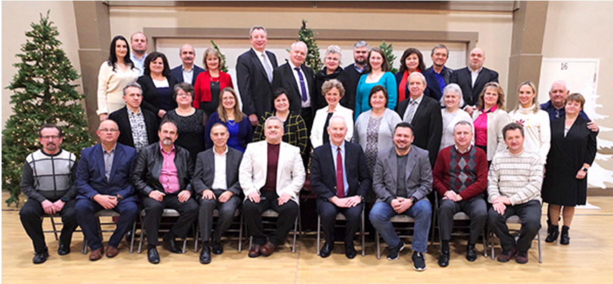
Members of the Committee and department leaders with their spouses