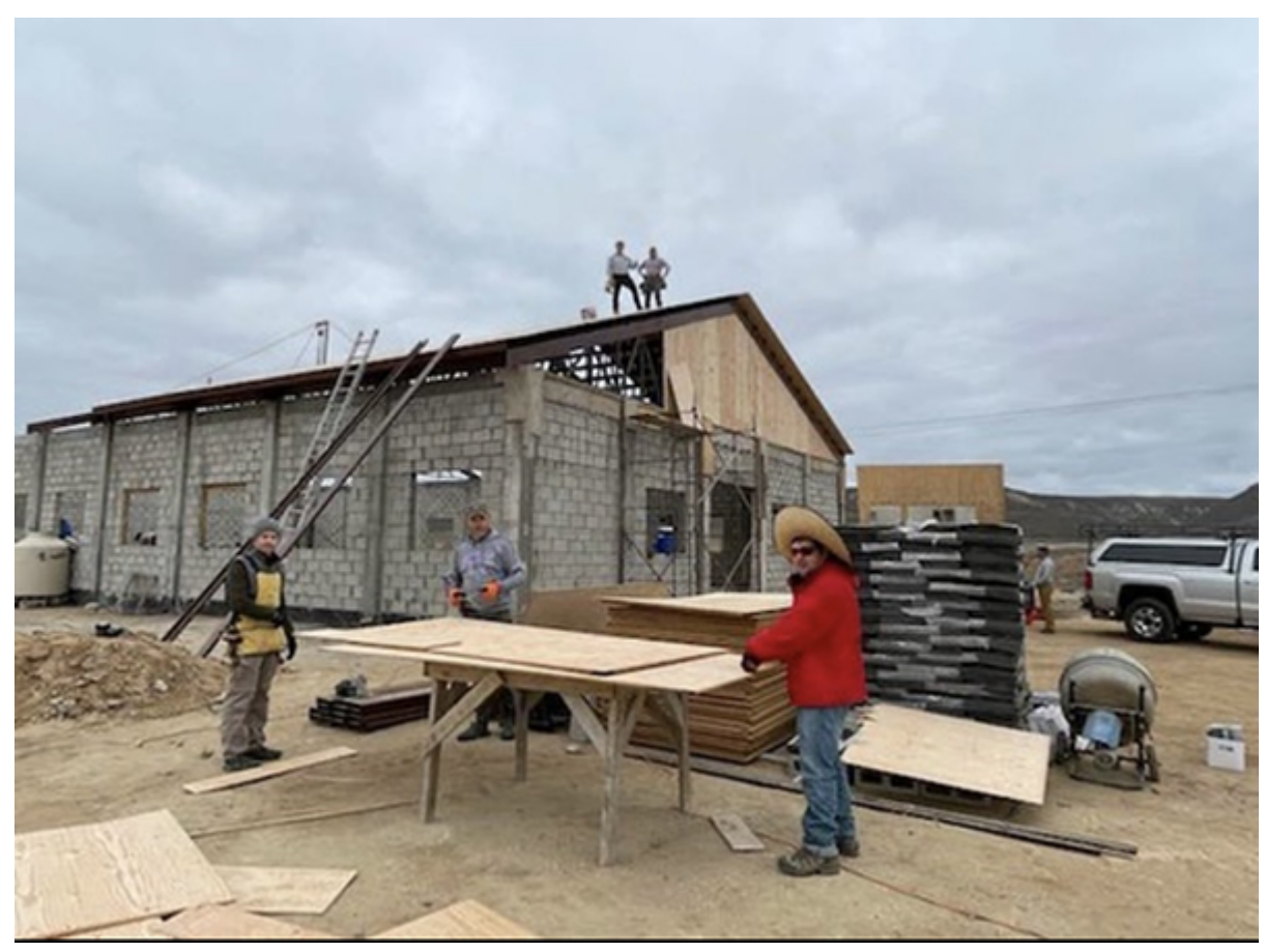
Building a Church in Mexico