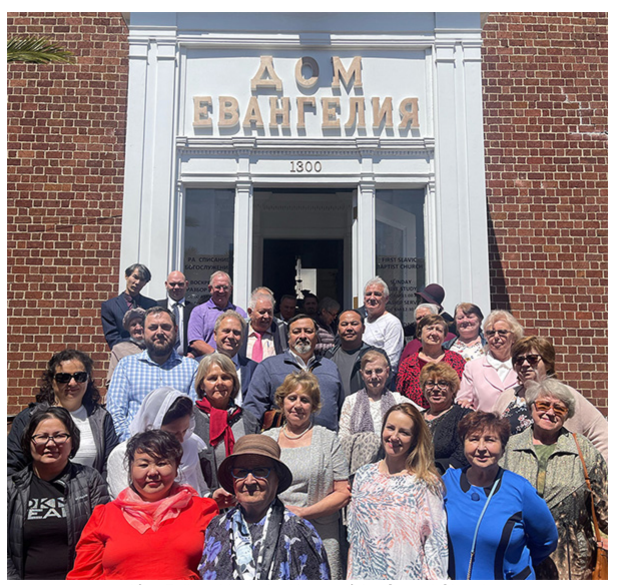
After Fellowship at the House of the Gospel Church