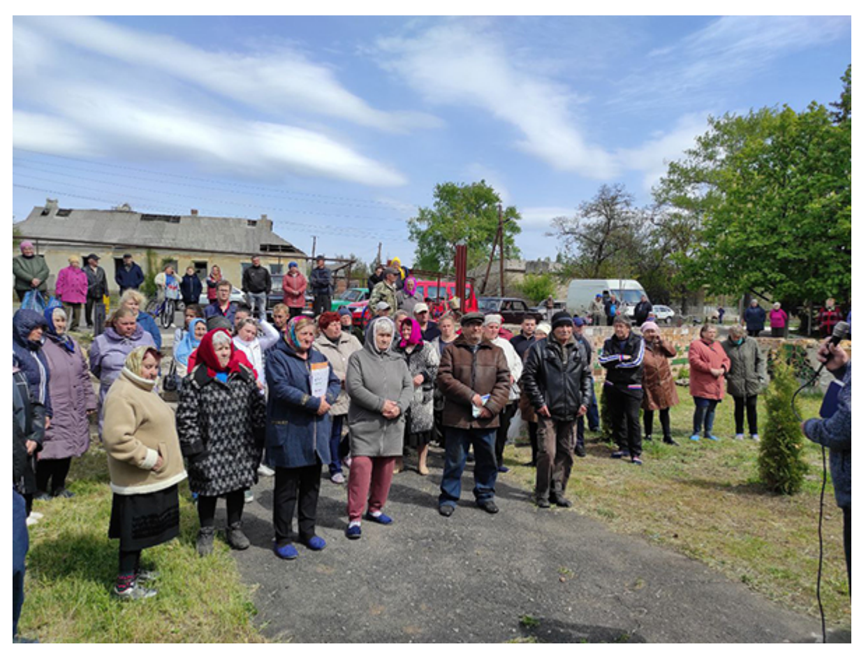
Church Service in a Village