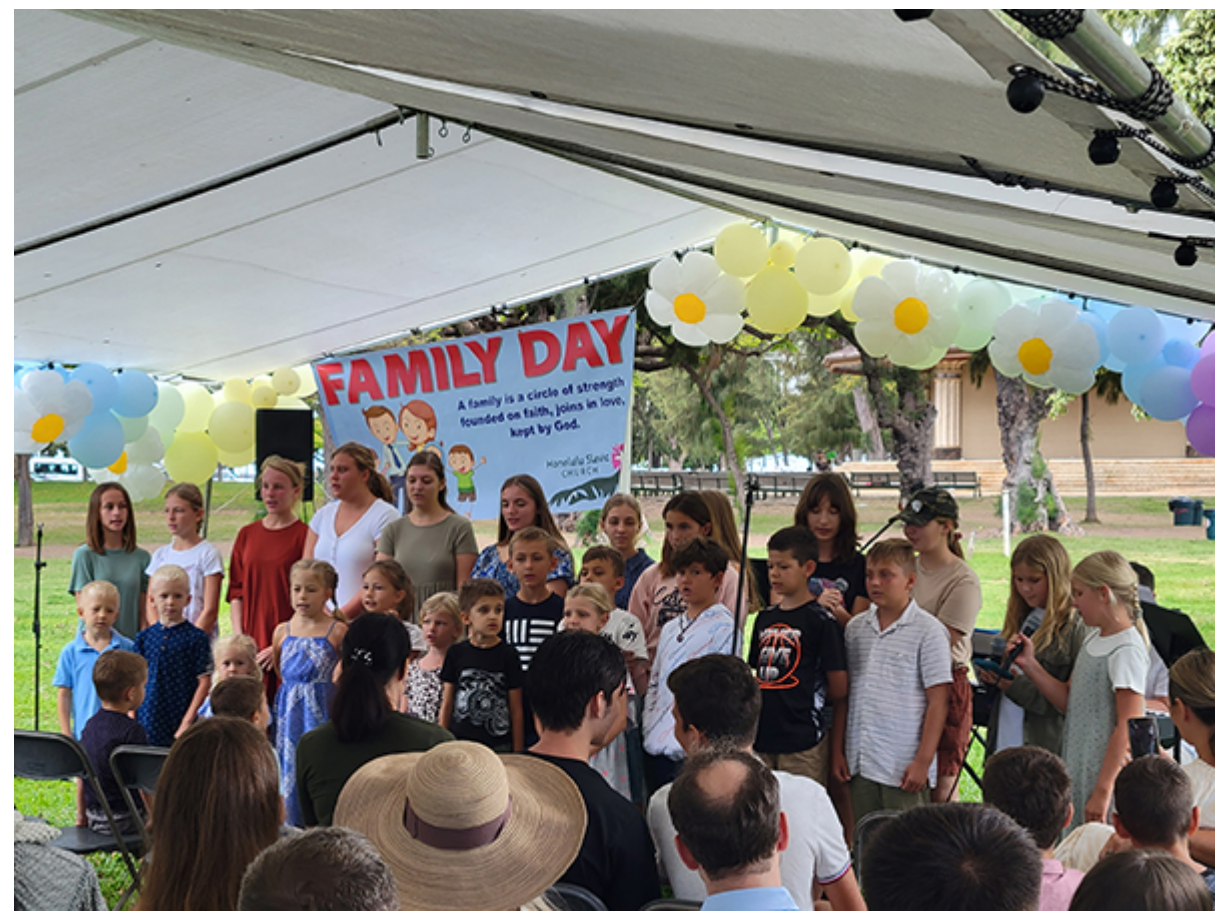
Children also Participated in the Church Service

event which emphasized the importance of the family as the union of one man and one woman created by God in His likeness and image and for His purpose. About 140 people joined this joyful celebration including families of guests from Ukraine, Belarus, as well as attendees from Washington, California, and New Jersey. For more information, read on the Association's website.