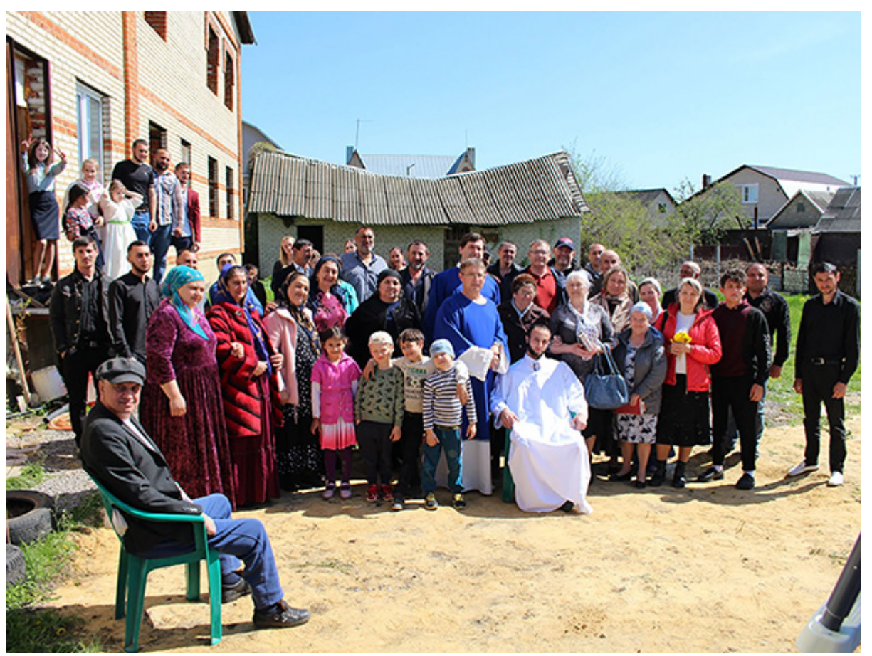
A Group of Gypsy Believers after The Baptism Service for One More Young Member