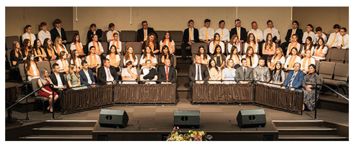
The new ministers with their spouses sit in the front row

Read here about the ordination (in Russian only) which took place on May 22, and watch the recording of the church service on the church' YouTube channel.