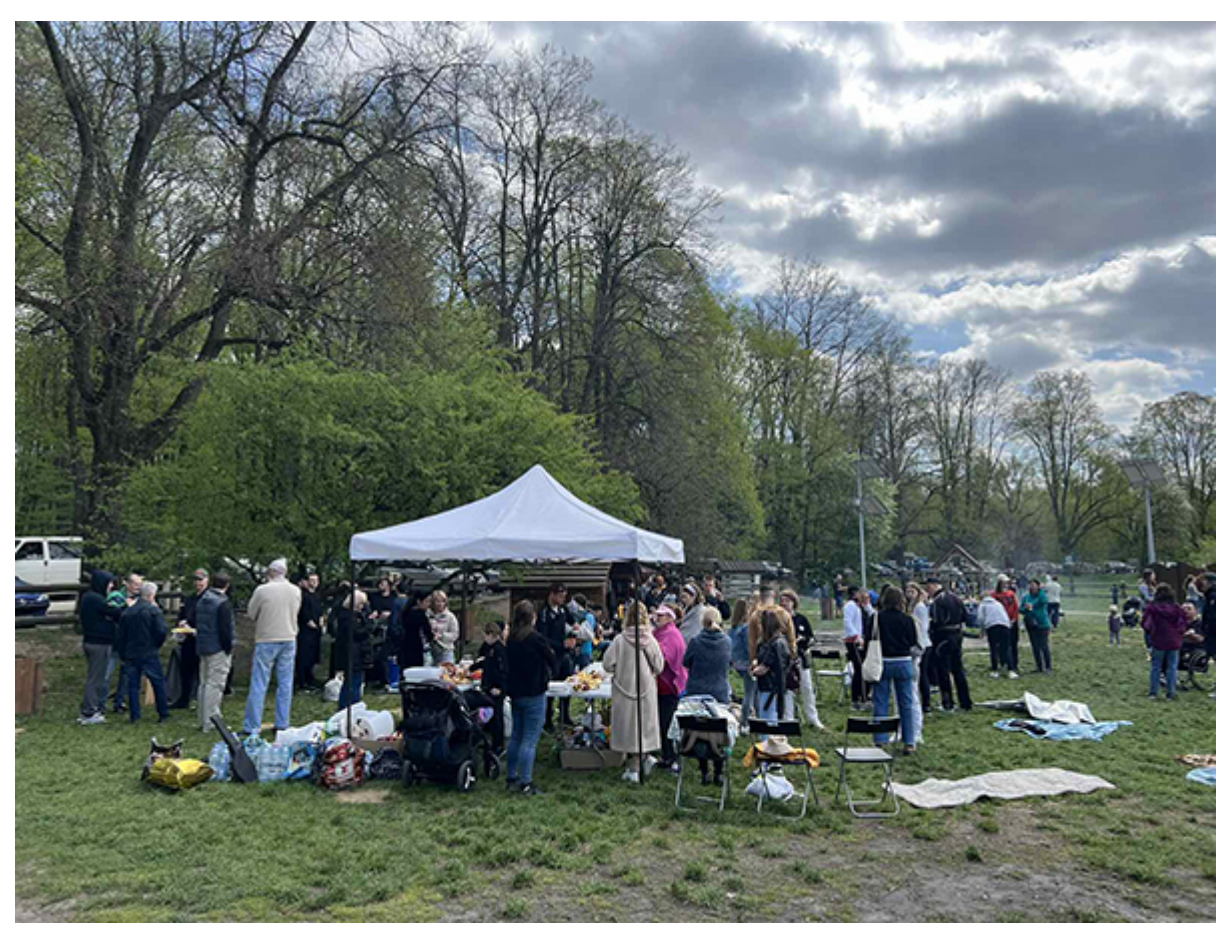
Picnic for Refugees