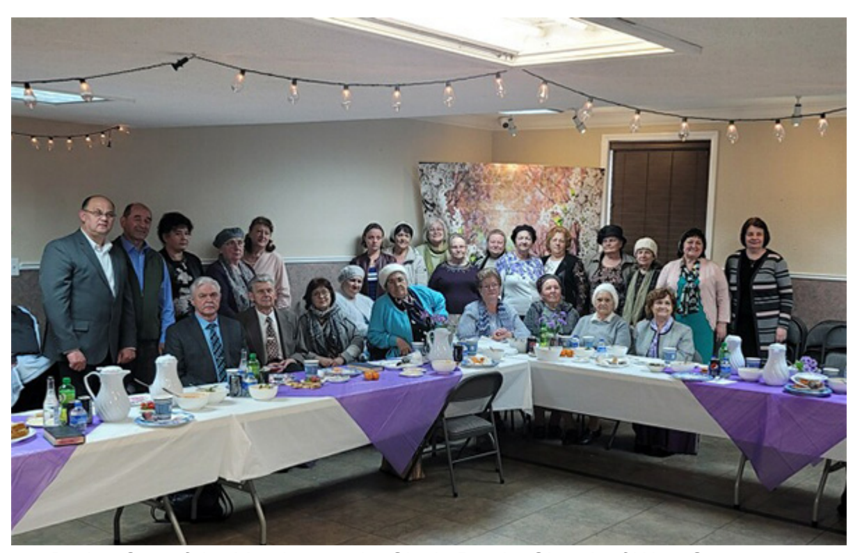
During One of the Meetings at the Slavic Baptist Church of West Sacramento