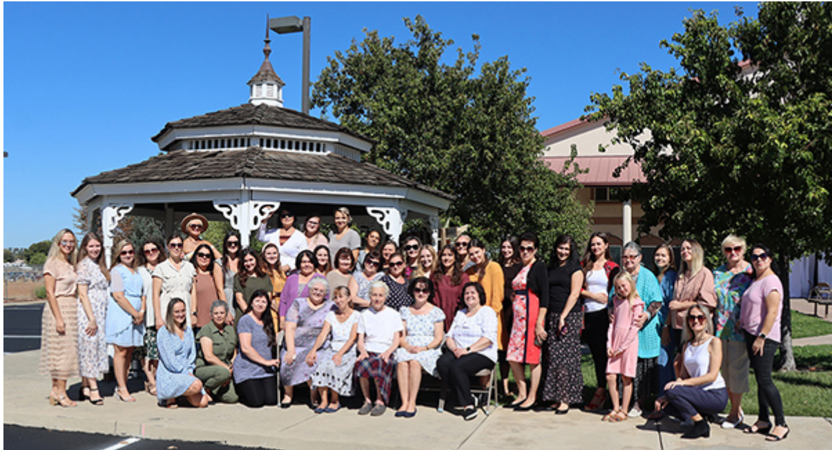
Daughters of the King