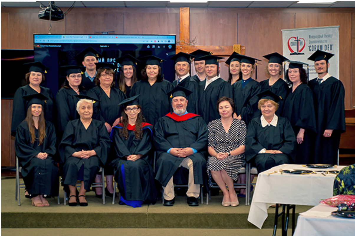
Graduates and Some of the Instructors