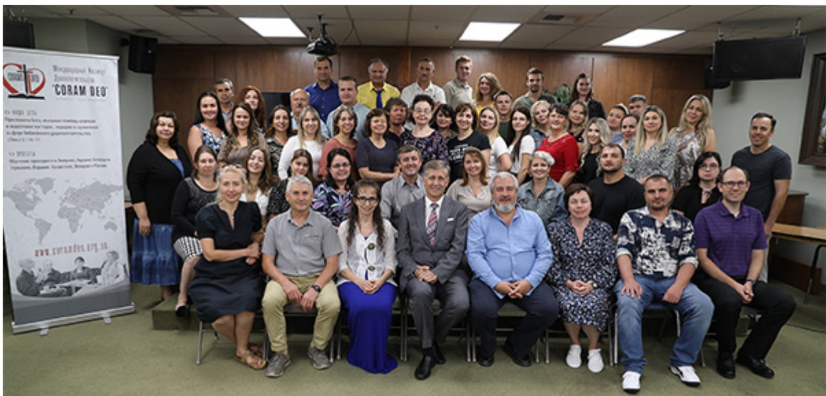
New group of students

Blagovest Institute of Ministry is partnering with the International Institute of Discipleship, “Coram Deo”, and will be helping in organizing and providing training for those who wish to do biblical counseling. The new group of students began their first session on October 4, at the Bryte Church. More than fifty people from the churches in Sacramento completed the first of twelve modules. There will be an additional enrollment opportunity in December. Read more here.