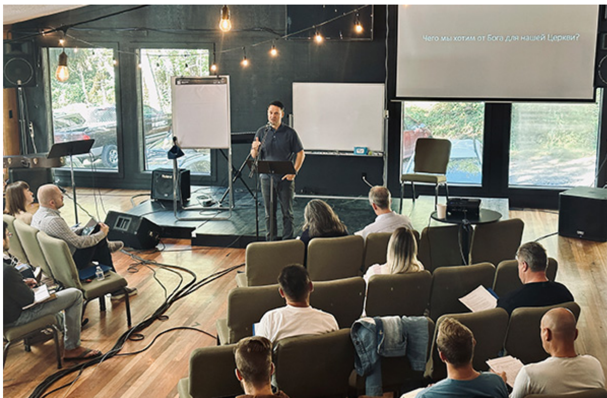
During the Retreat