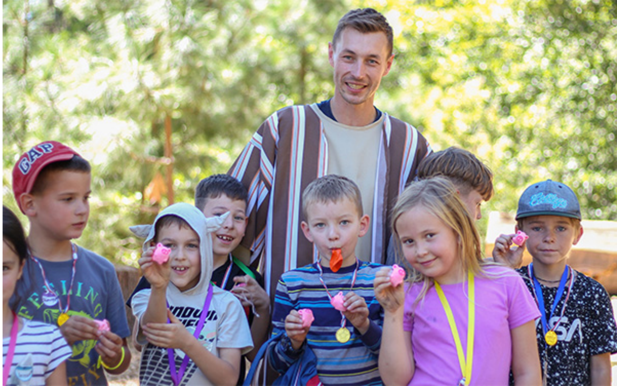
The camp brought special joy to children