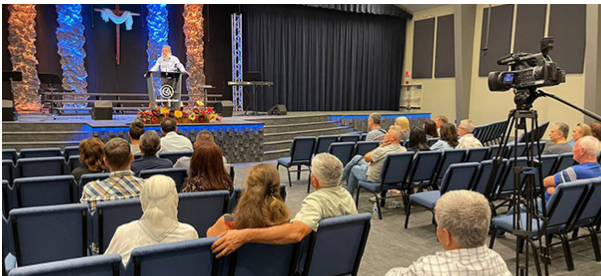
During the seminar