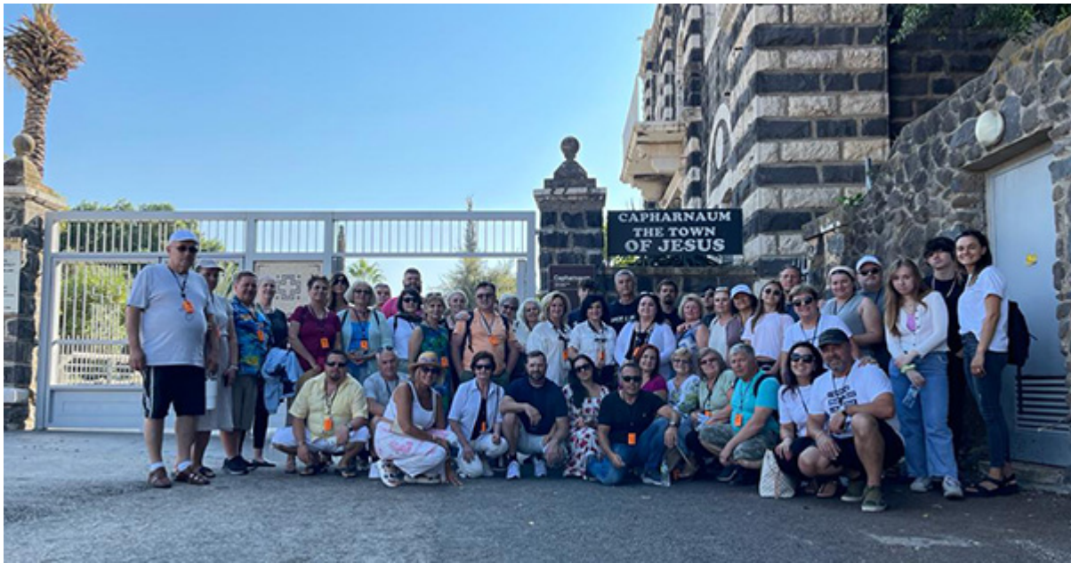
In Capernaum, the city of Jesus Christ