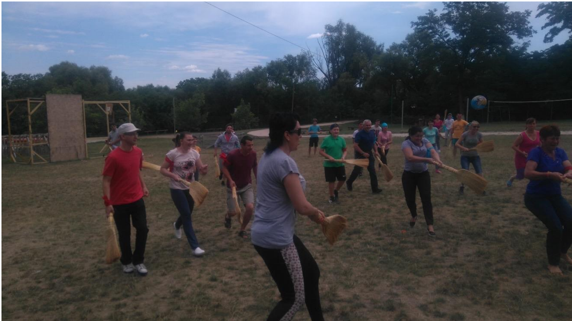
Popular game - "Metlobal"

from non-Baptist families. After experiencing deep stress due to the illness of their children, these fathers and mothers are very open to conversations about God and eternity. This camp has been conducted for 10 years already. More than 500 children went through it and heard the message of salvation in Christ.