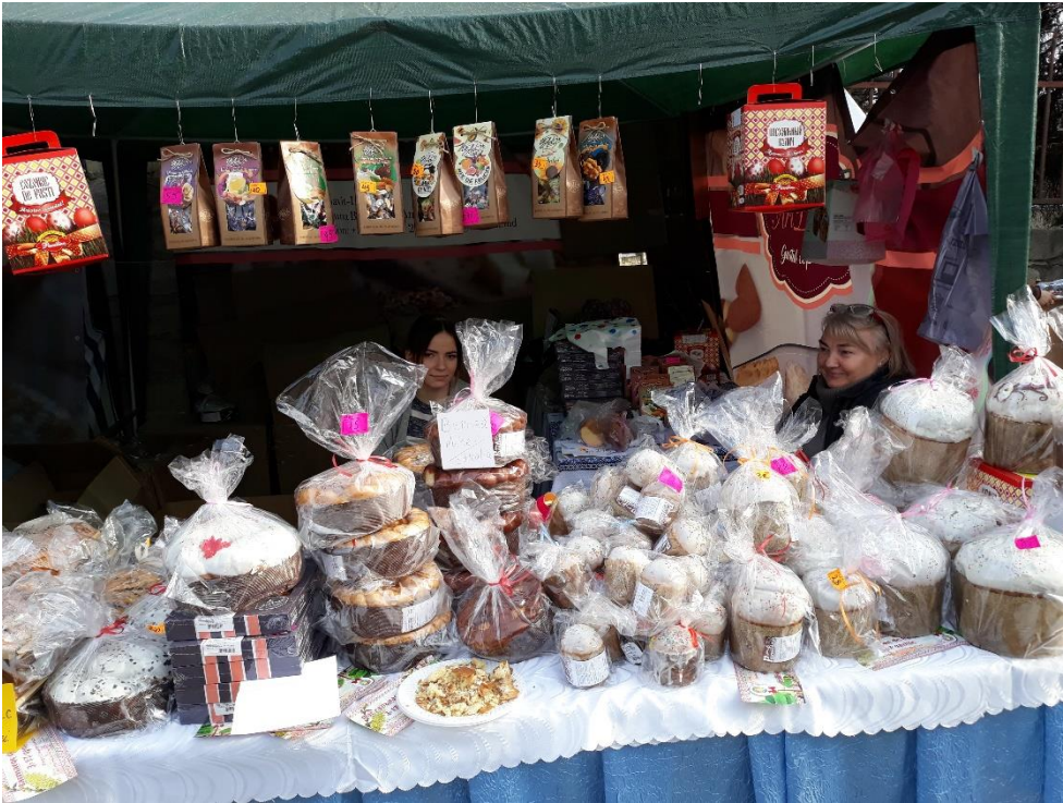
During the Easter season, the streets are spotted with kiosks selling various Easter cakes. Many people actively celebrate the feast of Easter.

The Easter service in our church, Bethany, on Sunday, April 8th was particularly special. Attended by adults and children, who sang and recited poems. I had the honor to preach an Easter sermon.