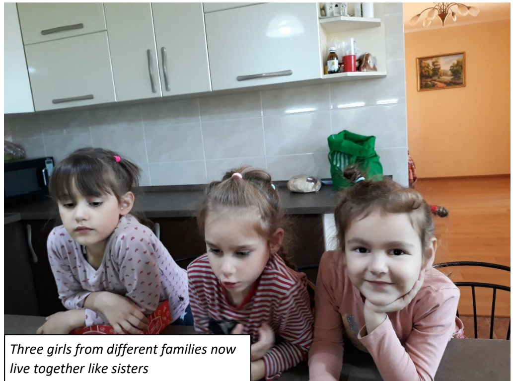
Three girls from different families now live together like sisters

After the end of the service and the festive dinner, we stopped at a family-type orphanage in this city. It has become our tradition to visit this house when we are in Benderi or Tiraspol. Both children and their parents welcome us. Of course, we do not come empty-handed. However, they are pleased not so much with our gifts, as with an opportunity to fellowship with us. For the parents, it is an