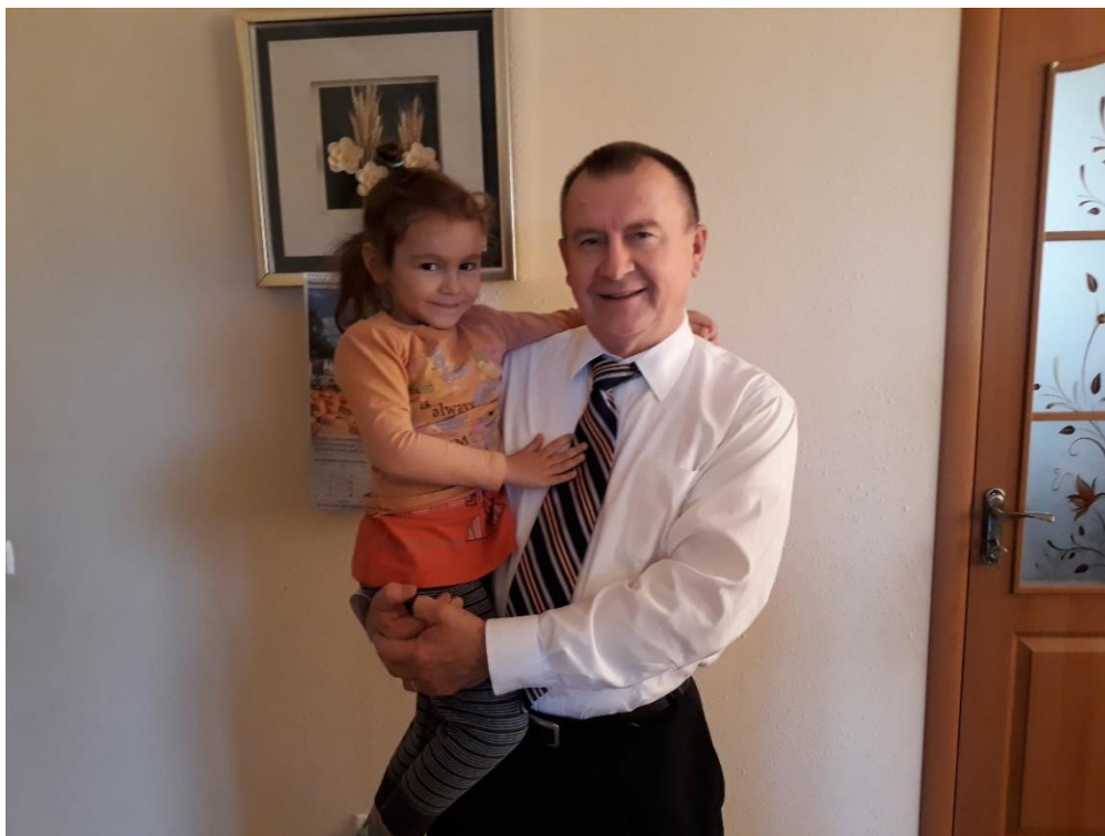
This 5-year-old girl really didn't want grandfather and grandmother to leave.

opportunity to share their experiences and concerns and pray with us. For the children, it is an opportunity to sit on the lap of a grandfather and grandmother from Chisinau. And for us it is a pleasant opportunity to show love for these little children, who so remind us of our grandchildren in America.