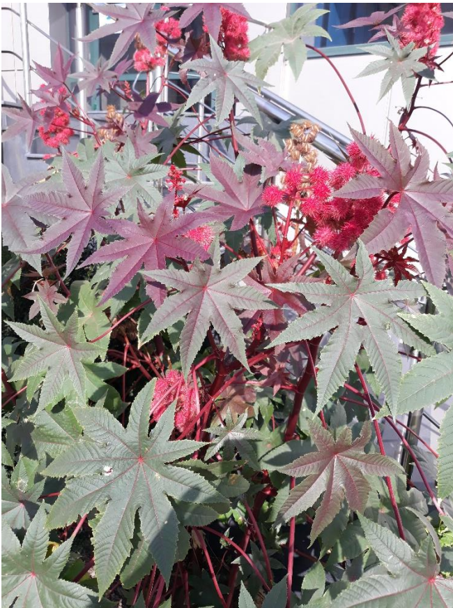
And these are autumn flowers of Chisinau.