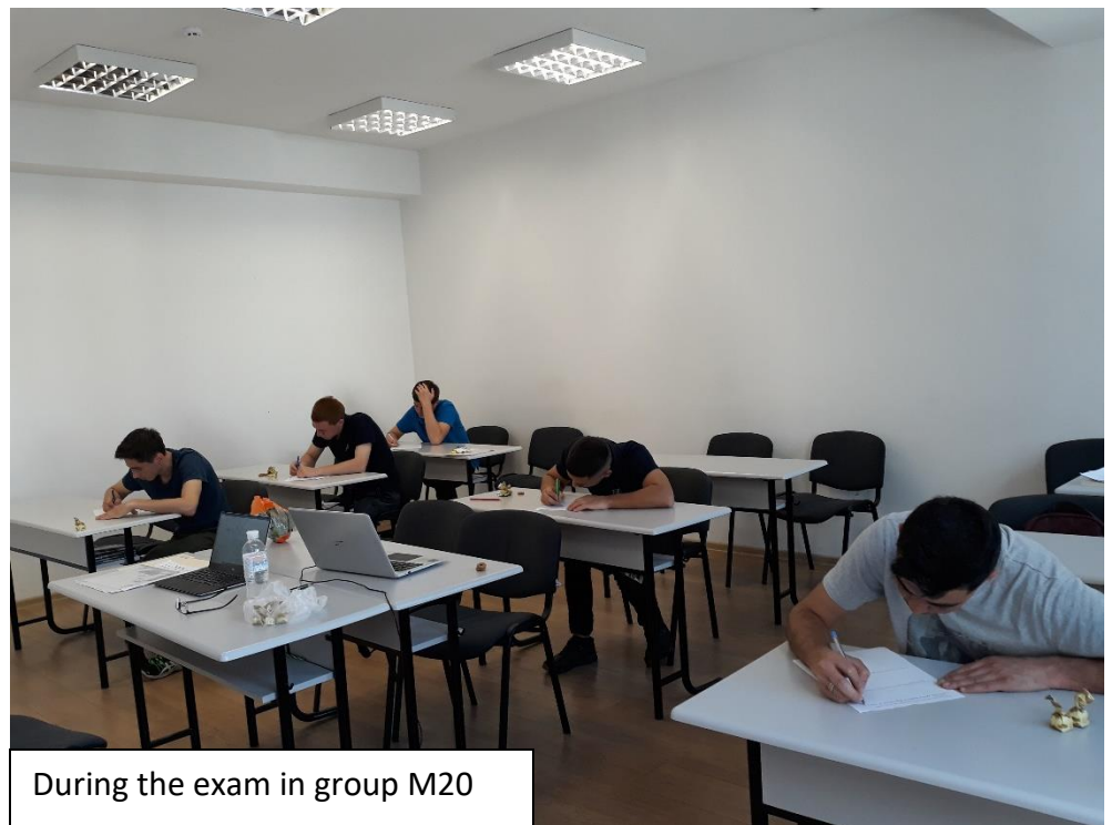
During the exam in group M20

On May 27 , an exam was held in group M20, in which those who are planning to participate in missionary service are trained. In this group, the demographic situation is different from S22. In the M20 group there are eight boys and two girls. This group also successfully passed the exam in my subject.