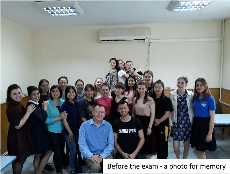
Before the exam - a photo for memory

At the university, May is an important time for both students and teachers. This is the time of exams, time to pass term papers, and time to defend theses. On May 20th, there was an exam on my subject: Intercultural Relations in the S22 group, in which future social workers study. An interesting feature of this group is the fact that it has 20 girls and one young man! The exam went well, most students received high marks.