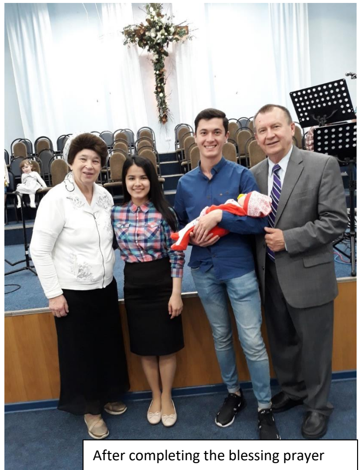
After completing the blessing prayer