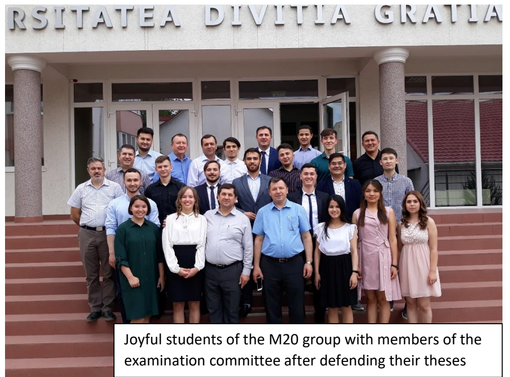
Joyful students of the M20 group with members of the examination committee after defending their theses