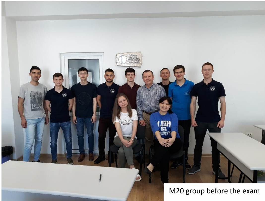
M20 group before the exam

On May 27 , an exam was held in group M20, in which those who are planning to participate in missionary service are trained. In this group, the demographic situation is different from S22. In the M20 group there are eight boys and two girls. This group also successfully passed the exam in my subject.