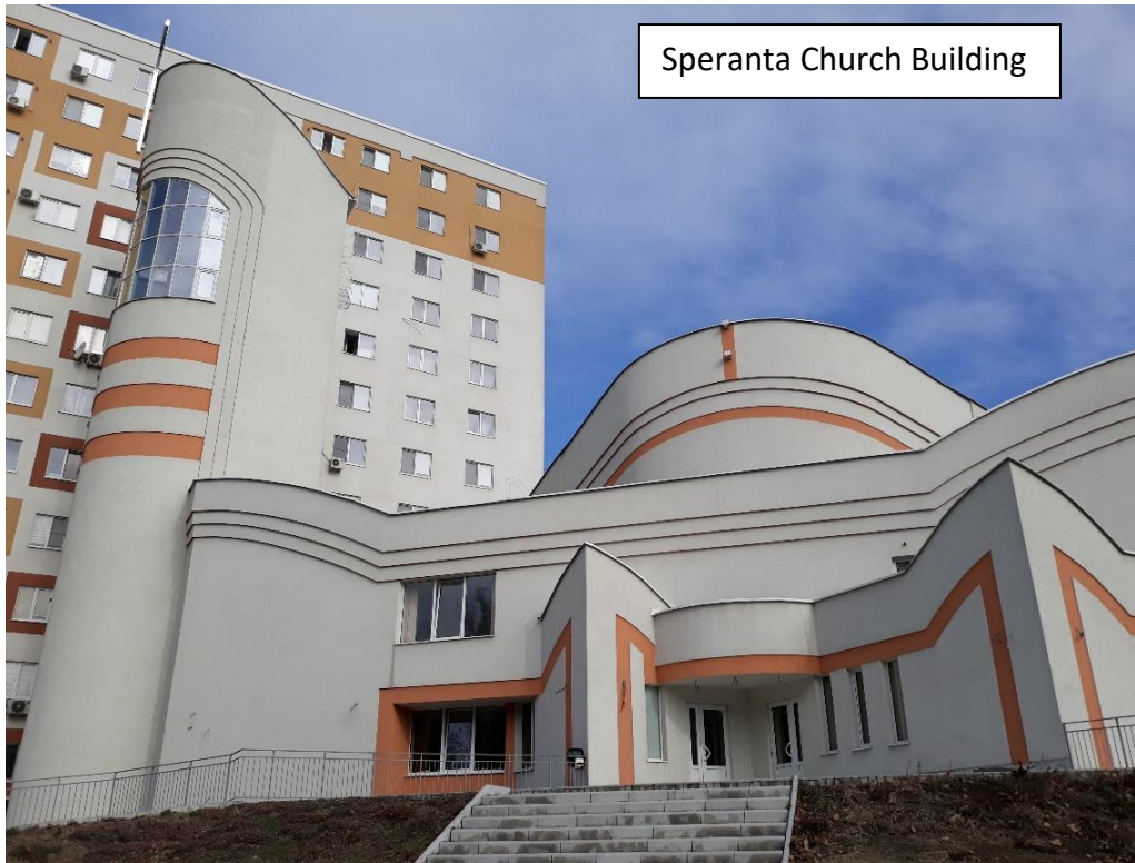
Speranta Church Building

On March 17 , on Sunday, we visited one of the Baptist churches in Chisinau - Speranta Church, which means Hope . I was invited to give a sermon. The service in the church is in Romanian, so I preached in Russian with translation into Romanian. There were many prayers during the service. There are more than 200 members in the church. The community conducts active missionary and social work, and supports the