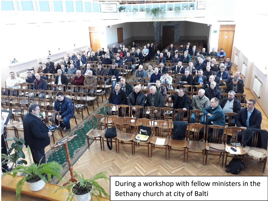
During a workshop with fellow ministers in the Bethany church at city of Balti