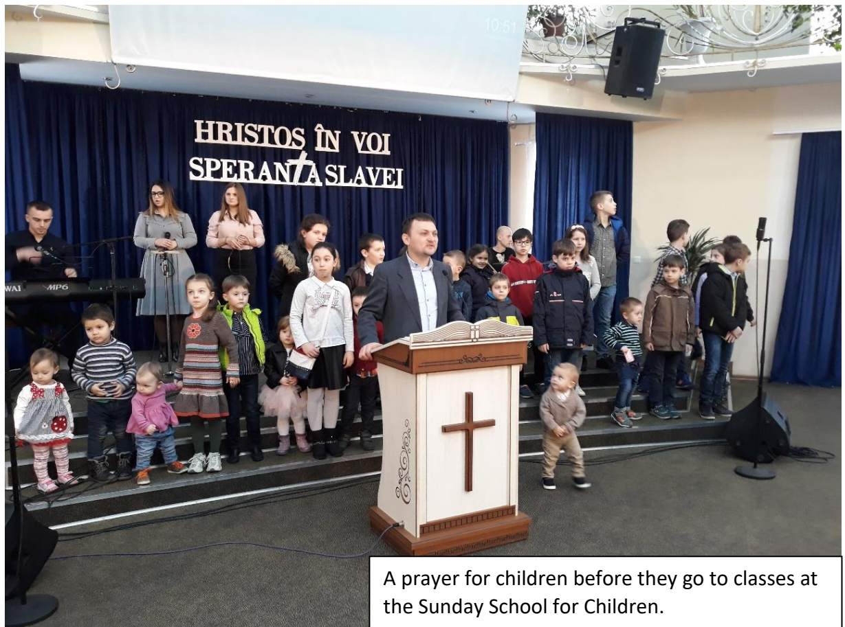
A prayer for children before they go to classes at the Sunday School for Children.

ministry in rural churches. We were pleased to be in this community.