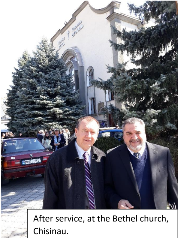
After service, at the Bethel church, Chisinau.