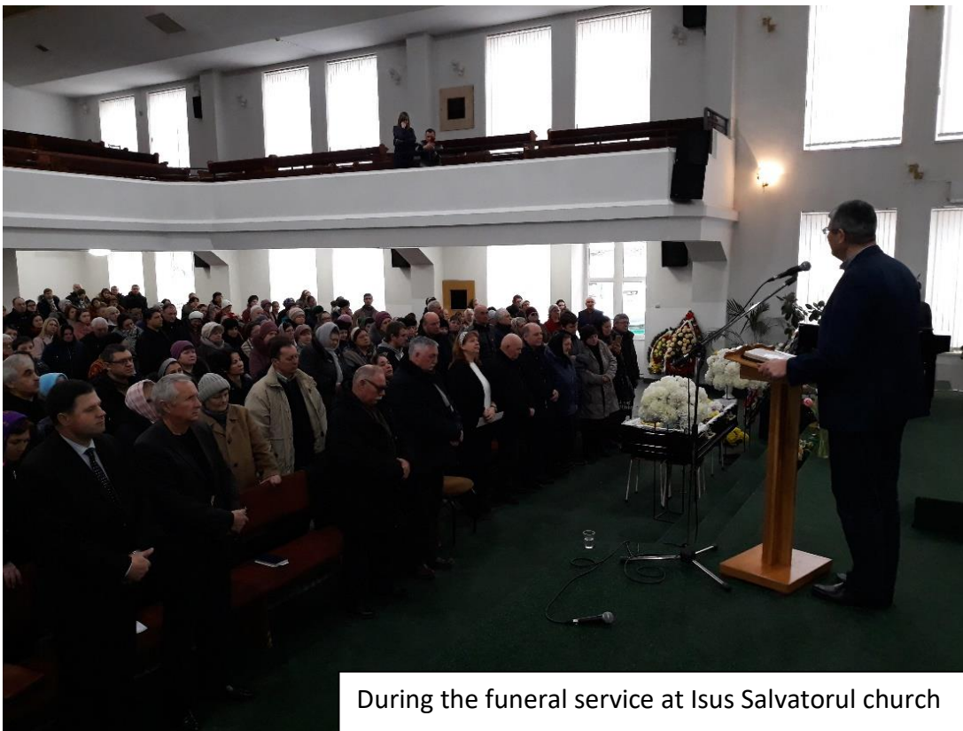
During the funeral service at Isus Salvatorul church