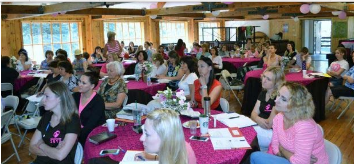
Women's Retreat "Moms in prayer"