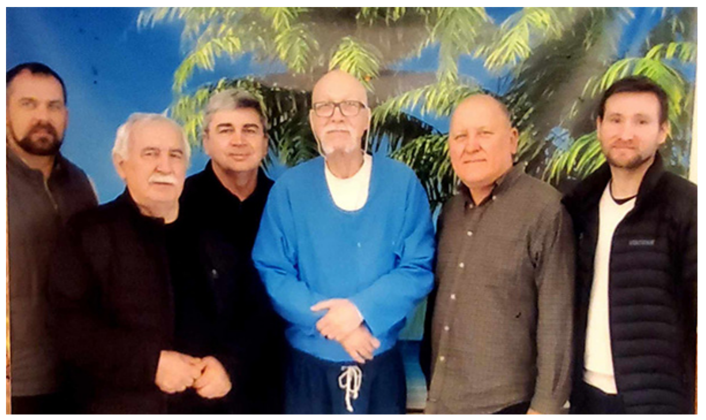
During one of the visits...