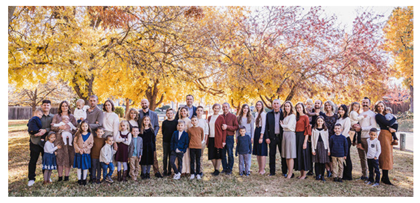
What an Amazing Posterity!